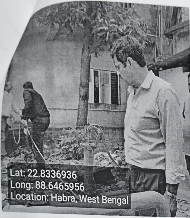
Lat: 22.8336936 Long: 88.6465956 Location: Habra, West Bengal