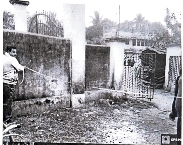
Khirpai, West Bengal, India Pj4c+fg9, Khirpai, West Bengal 721232, India Lat 22.706416° Long 87.621296° Wednesday, 17/12/2025 03:31 PM GMT +05:30