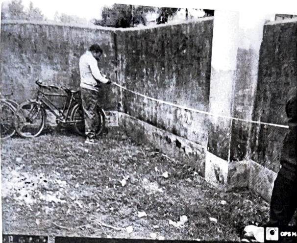
Khirpai, West Bengal, India Pj4c+fg9, Khirpai, West Bengal 721232, India Lat 22.706414° Long 87.62125° Wednesday, 17/12/2025 03:30 PM GMT +05:30