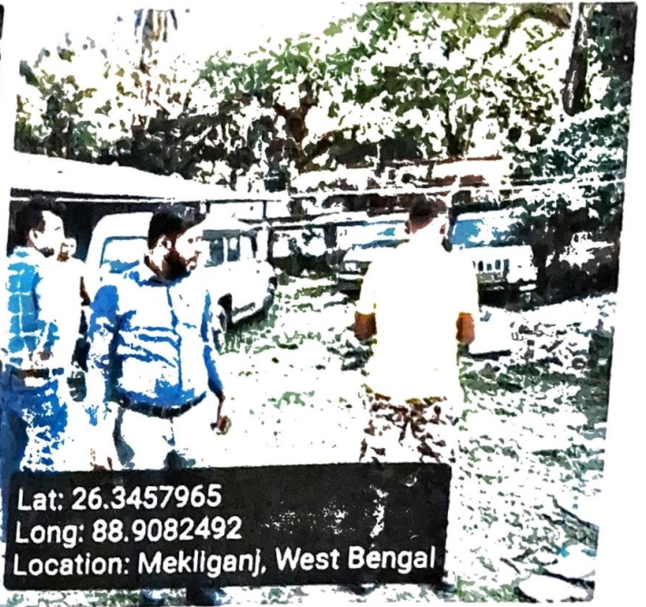
Lat: 26.3457965 Long: 88.9082492 Location: Mekliganj, West Bengal