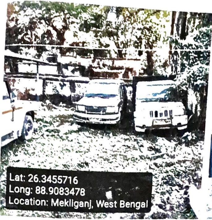
Lat: 26.3455716 Long: 88.9083478 Location: Mekliganj, West Bengal