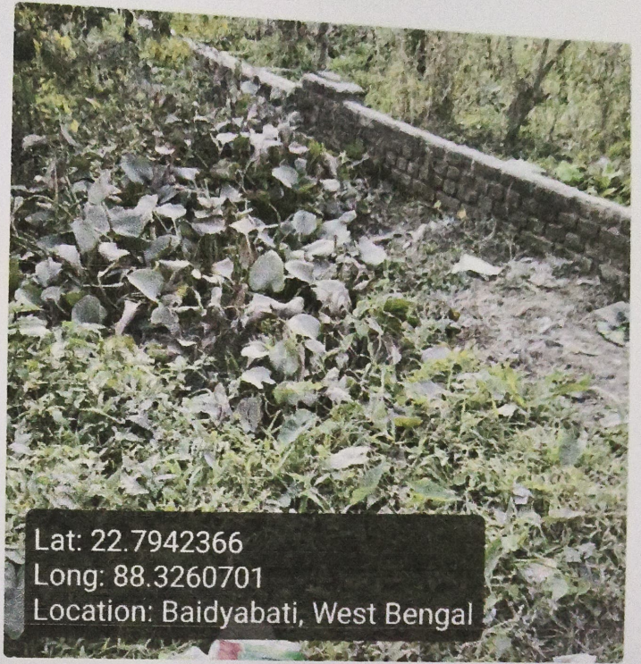
Lat: 22.7942366 Long: 88.3260701 Location: Baidyabati, West Bengal