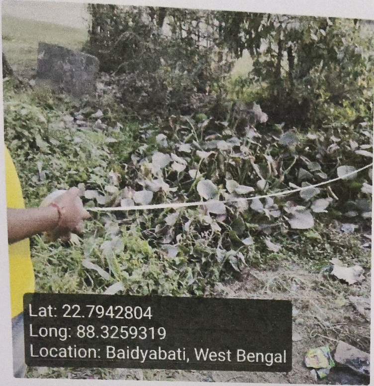
Lat: 22.7942804 Long: 88.3259319 Location: Baidyabati, West Bengal