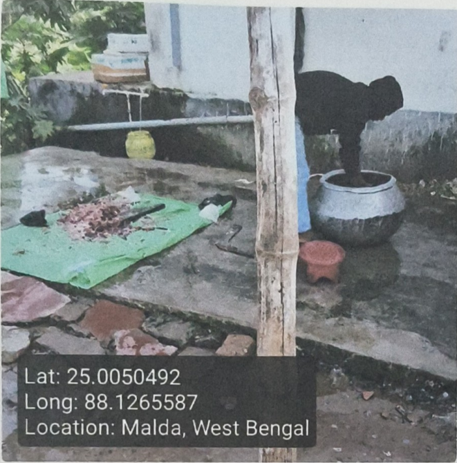
Lat: 25.0050492 Long: 88.1265587 Location: Malda, West Bengal