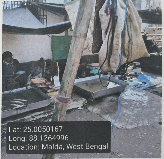
Lat: 25.0050167 Long: 88.1264996 Location: Malda, West Bengal