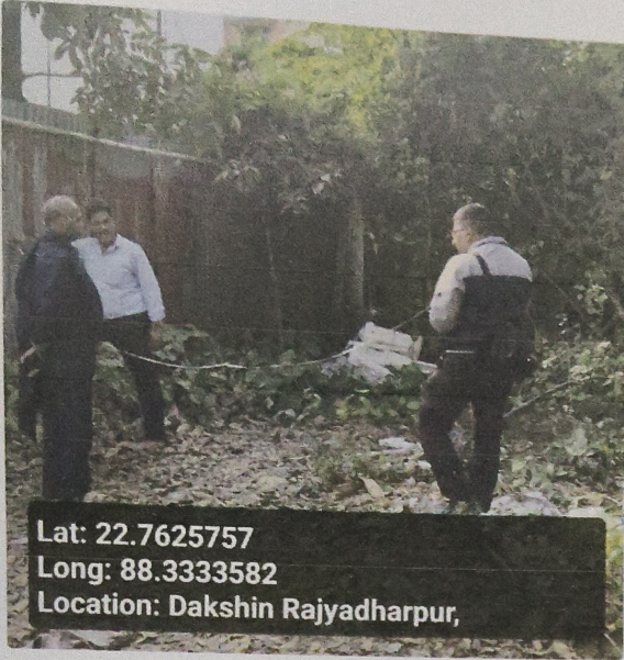
Lat: 22.7625757 Long: 88.3333582 Location: Dakshin Rajyadharpur,