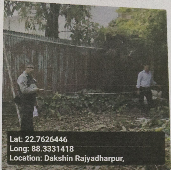
Lat: 22.7626446 Long: 88.3331418 Location: Dakshin Rajyadharpur,