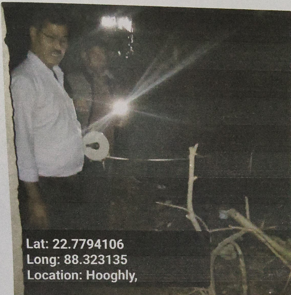
Lat: 22.7794106 Long: 88.323135 Location: Hooghly,