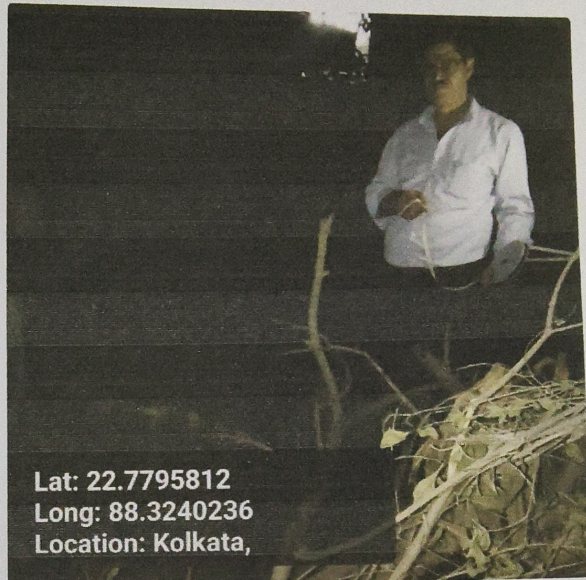
Lat: 22.7795812 Long: 88.3240236 Location: Kolkata,