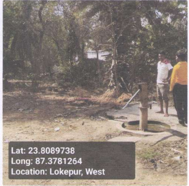
Lat: 23.8089738 Long: 87.3781264 Location: Lokepur, West