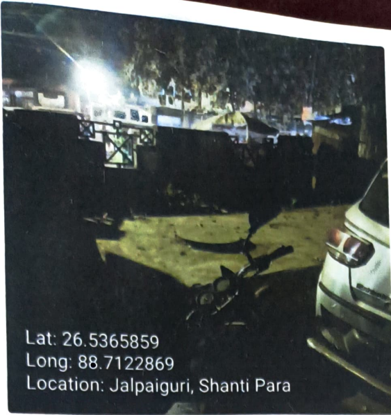
Lat: 26.5365859 Long: 88.7122869 Location: Jalpaiguri, Shanti Para