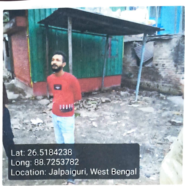
Lat: 26.5184238 Long: 88.7253782 Location: Jalpaiguri, West Bengal