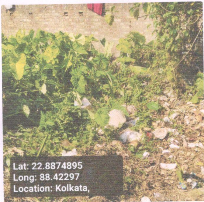
Lat: 22.8874895 Long: 88.42297 Location: Kolkata,