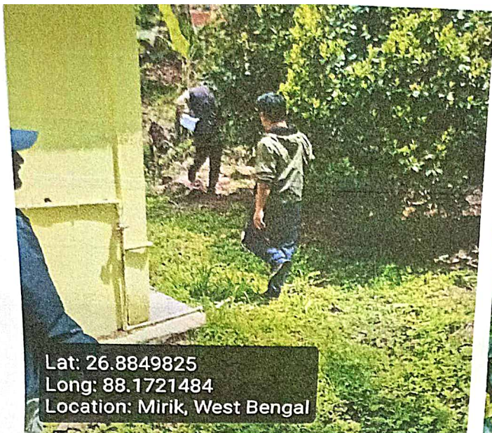
Lat: 26.8849825 Long: 88.1721484 Location: Mirik, West Bengal