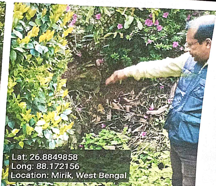
Lat: 26.8849858 Long: 88.172156 Location: Mirik, West Bengal