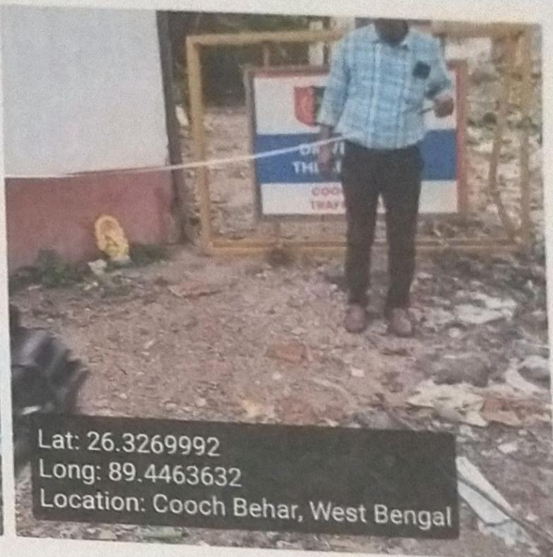
Lat: 26.3269992 Long: 89.4463632 Location: Cooch Behar, West Bengal