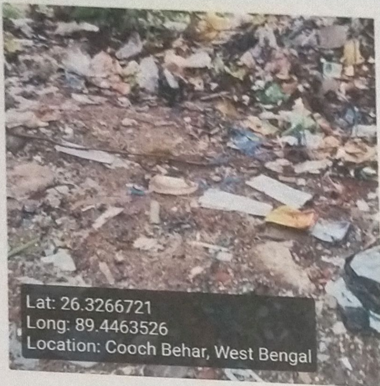
Lat: 26.3266721 Long: 89.4463526 Location: Cooch Behar, West Bengal