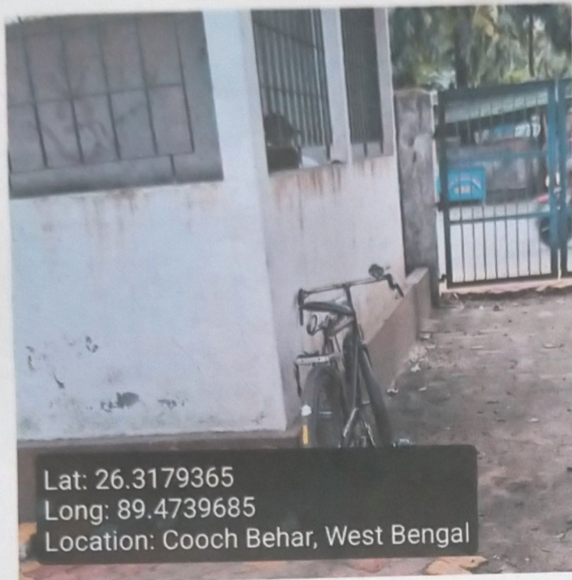
Lat: 26.3179365 Long: 89.4739685 Location: Cooch Behar, West Bengal