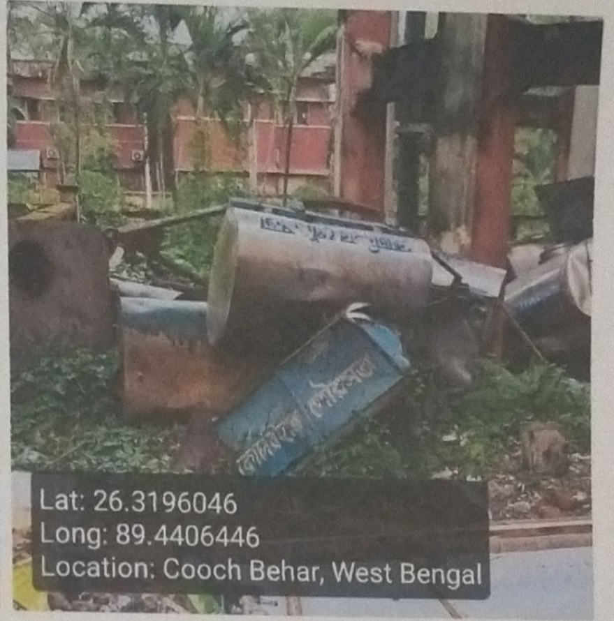
Lat: 26.3196046 Long: 89.4406446 Location: Cooch Behar, West Bengal