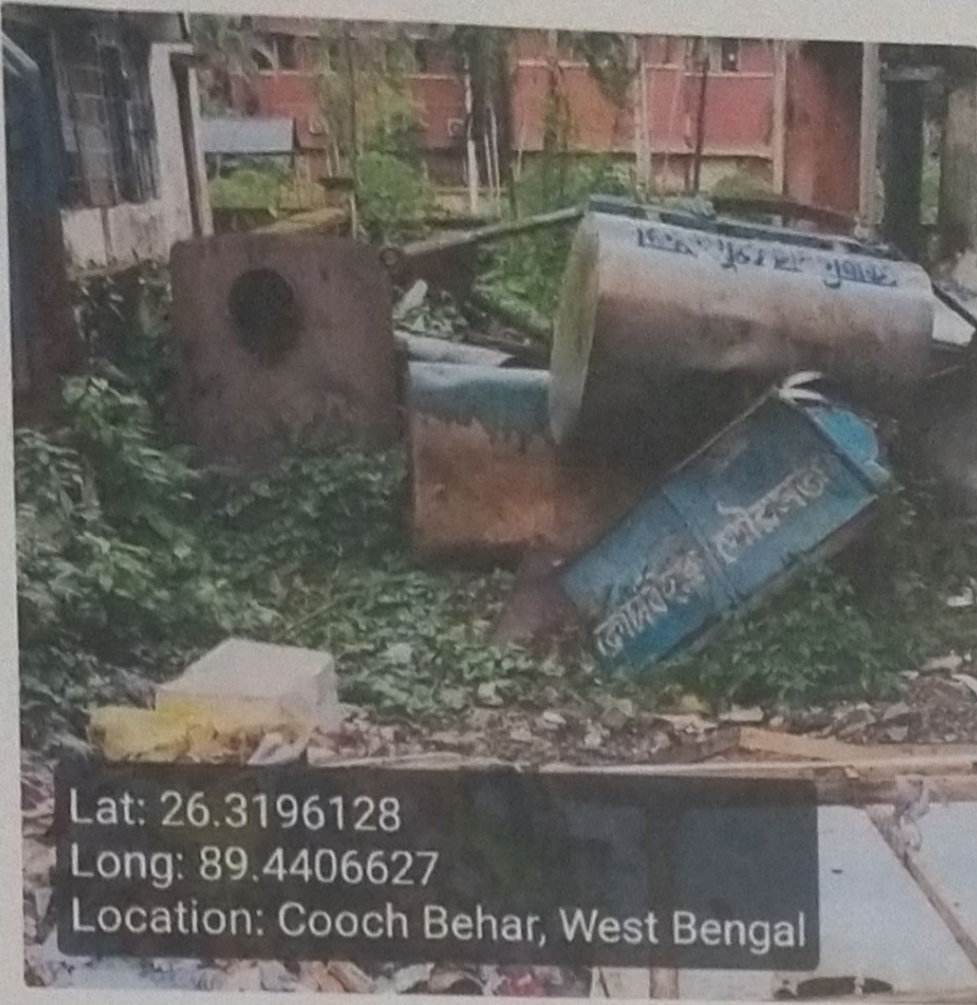
Lat: 26.3196128 Long: 89.4406627 Location: Cooch Behar, West Bengal