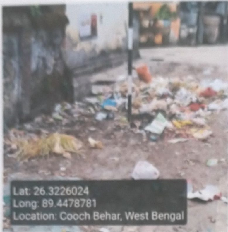
Lat: 26.3226024 Long: 89.4478781 Location: Cooch Behar, West Bengal