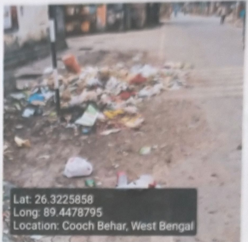
Lat: 26.3225858 Long: 89.4478795 Location: Cooch Behar, West Bengal