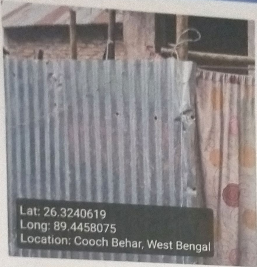
Lat: 26.3240619 Long: 89.4458075 Location: Cooch Behar, West Bengal