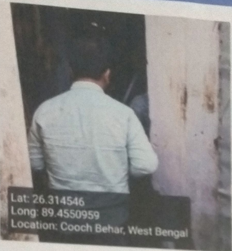
Lat: 26.314546 Long: 89.4550959 Location: Cooch Behar, West Bengal