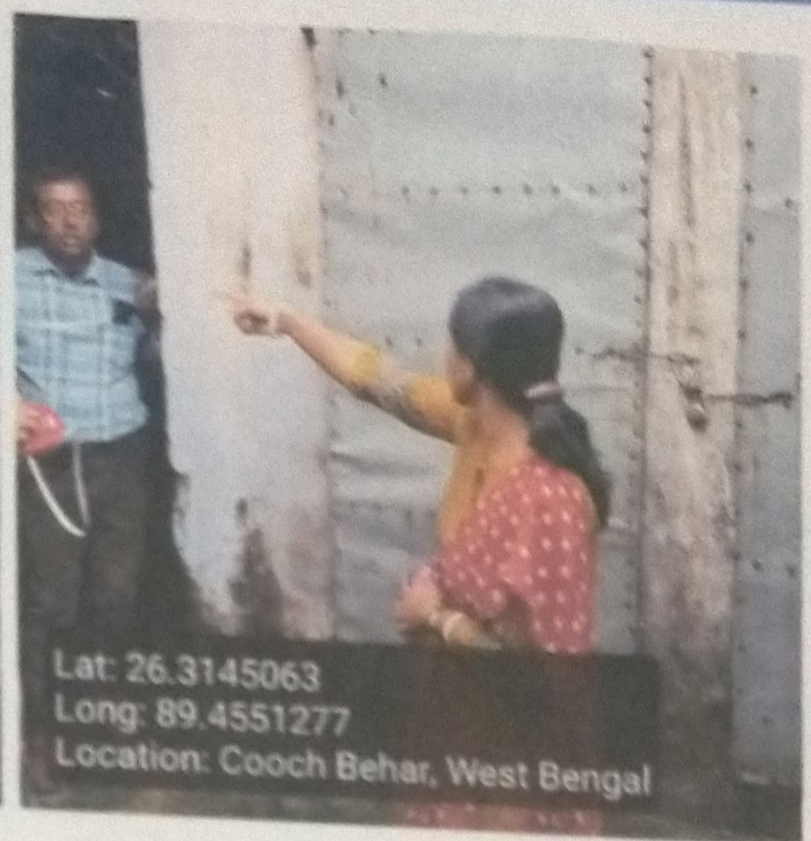
Lat: 26.3145063 Long: 89.4551277 Location: Cooch Behar, West Bengal