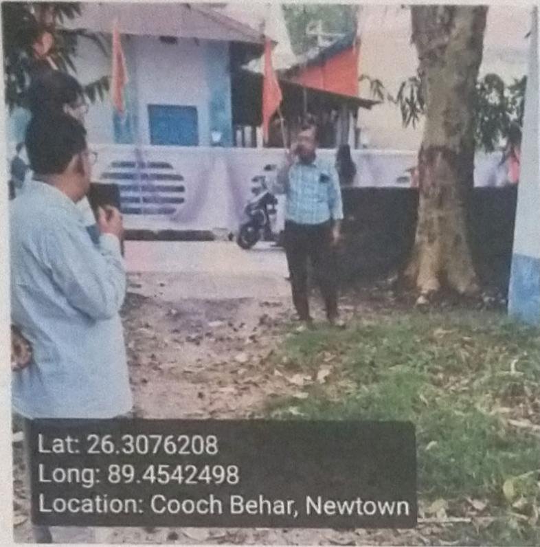
Lat: 26.3076208 Long: 89.4542498 Location: Cooch Behar, Newtown