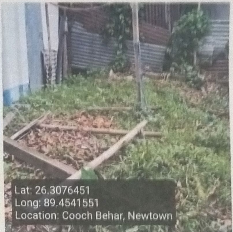
Lat: 26.3076451 Long: 89.4541551 Location: Cooch Behar, Newtown