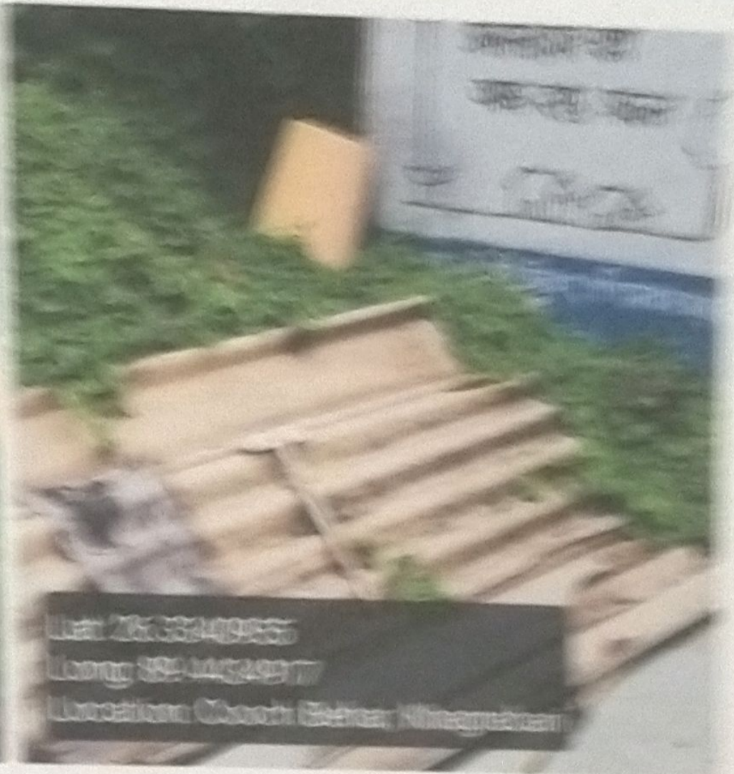
Ulat 26.334955 Long 89.4452977 Location: Cooch Behar, Nimgrahan