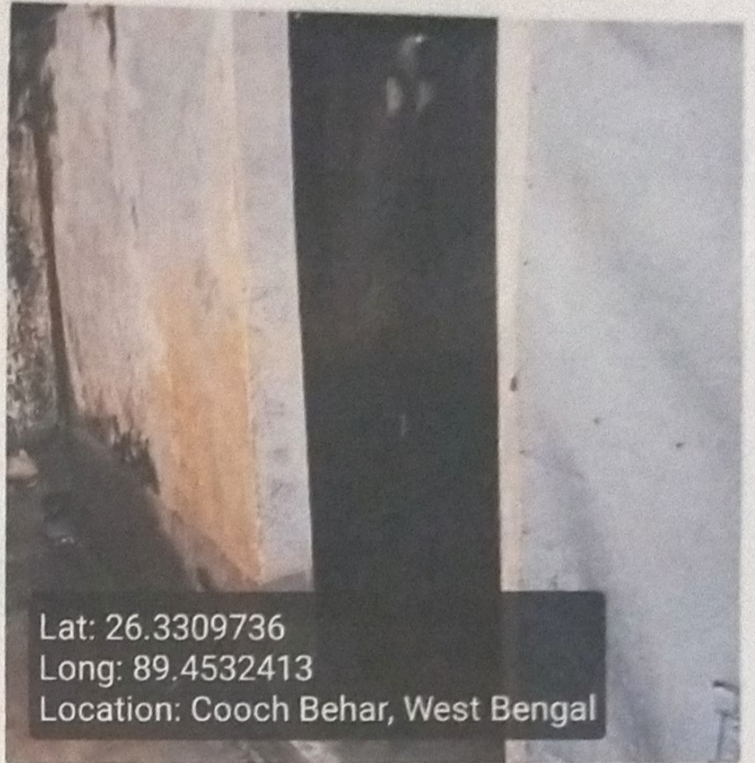
Lat: 26.3309736 Long: 89.4532413 Location: Cooch Behar, West Bengal