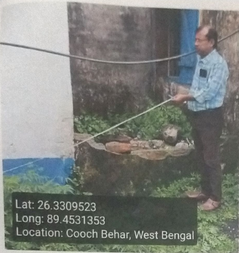
Lat: 26.3309523 Long: 89.4531353 Location: Cooch Behar, West Bengal