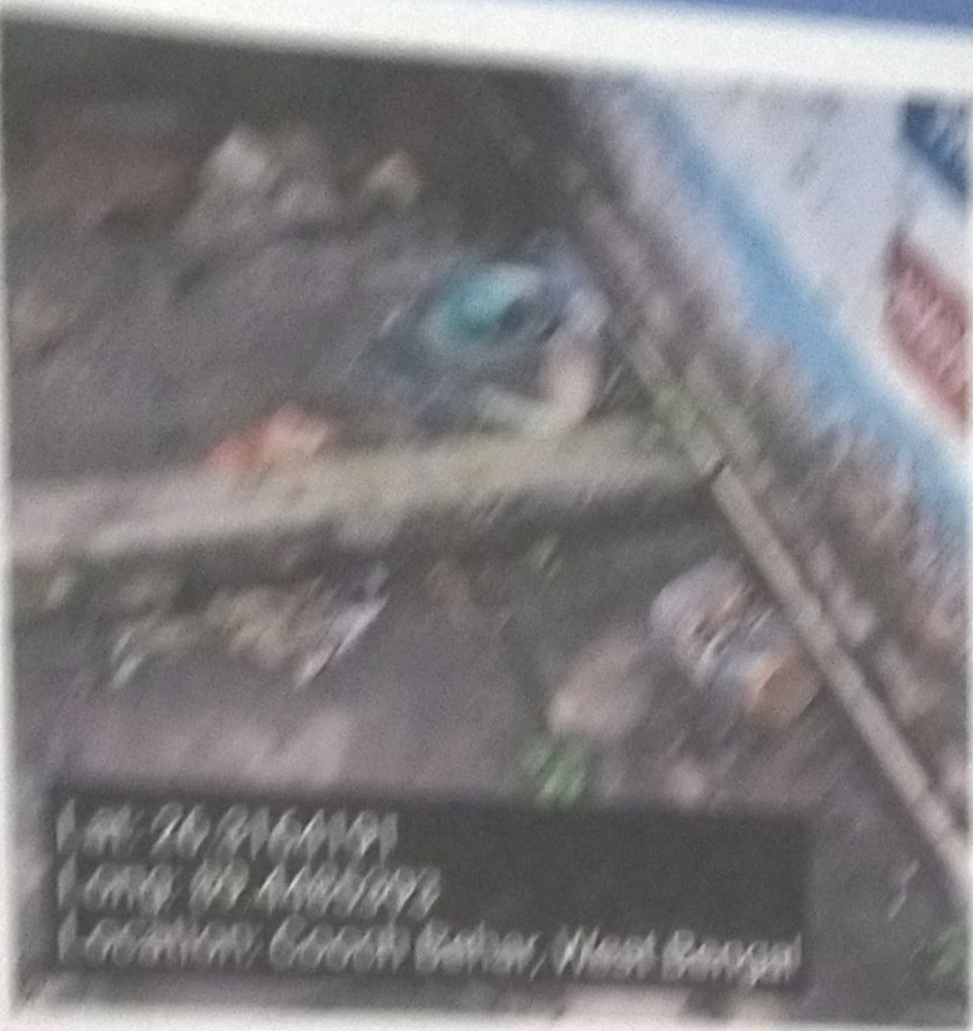
Lat: 26.9464191 Long: 89.4824273 Location: Gooch Bahar, West Bengal