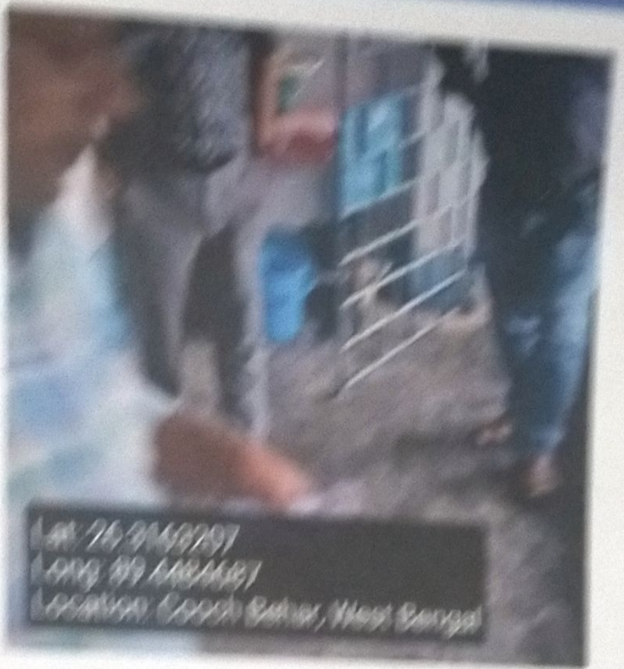
Lat: 26.9462797 Long: 89.4824271 Location: Gooch Bahar, West Bengal