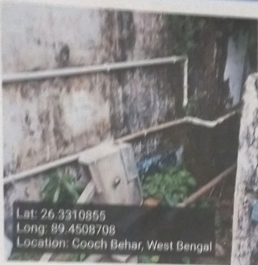
Lat: 26.3310855 Long: 89.4508708 Location: Cooch Behar, West Bengal