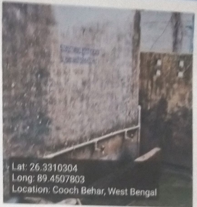
Lat: 26.3310304 Long: 89.4507803 Location: Cooch Behar, West Bengal