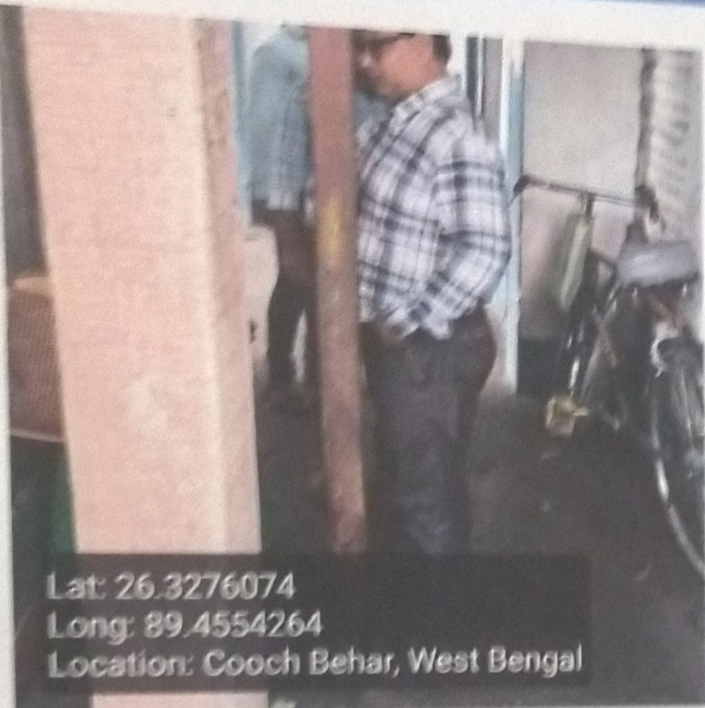
Lat: 26.3276074 Long: 89.4554264 Location: Cooch Behar, West Bengal