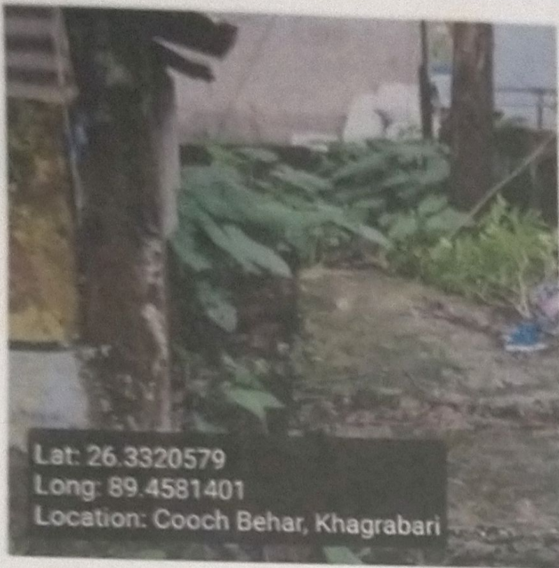
Lat: 26.3320579 Long: 89.4581401 Location: Cooch Behar, Khagrabari