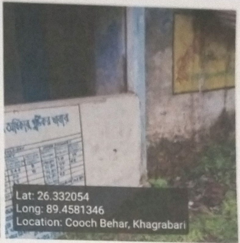
Lat: 26.332054 Long: 89.4581346 Location: Cooch Behar, Khagrabari