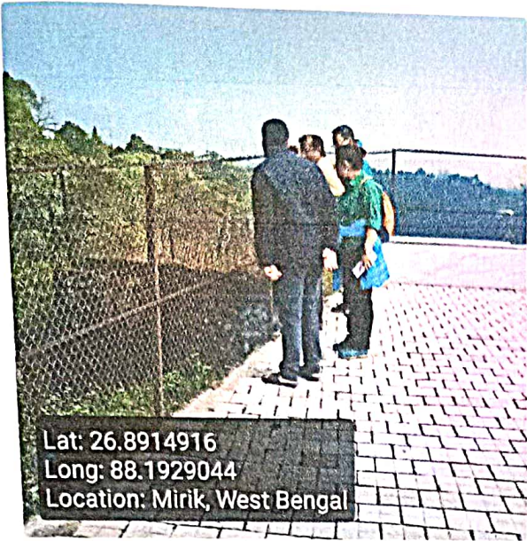
Lat: 26.8914916 Long: 88.1929044 Location: Mirik, West Bengal