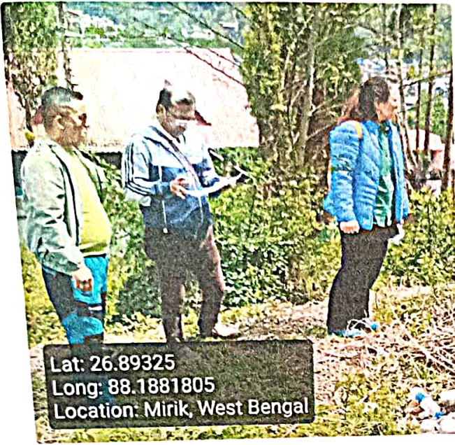
Lat: 26.89325 Long: 88.1881805 Location: Mirik, West Bengal