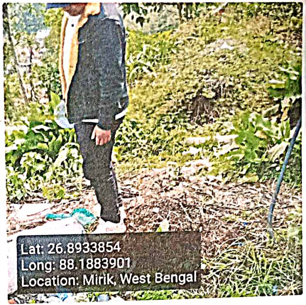
Lat: 26.8933854 Long: 88.1883901 Location: Mirik, West Bengal