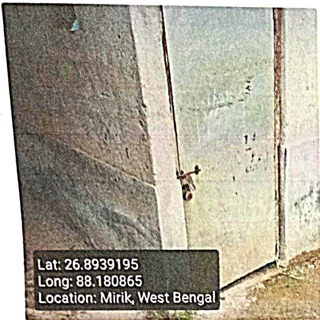
Lat: 26.8939195 Long: 88.180865 Location: Mirik, West Bengal