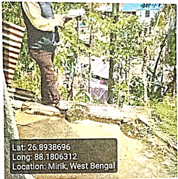
Lat: 26.8938696 Long: 88.1806312 Location: Mirik, West Bengal