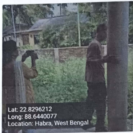
Lat: 22.8296212 Long: 88.6440077 Location: Habra, West Bengal