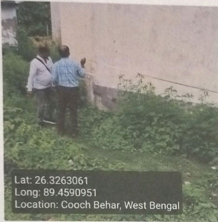
Lat: 26.3263061 Long: 89.4590951 Location: Cooch Behar, West Bengal