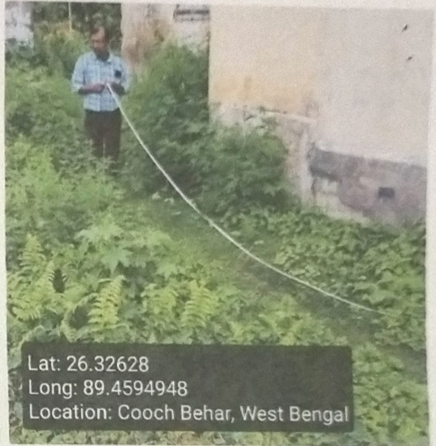
Lat: 26.32628 Long: 89.4594948 Location: Cooch Behar, West Bengal