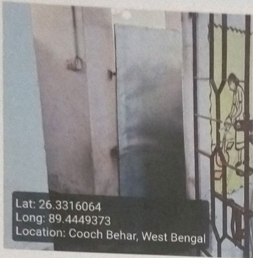
Lat: 26.3316064 Long: 89.4449373 Location: Cooch Behar, West Bengal