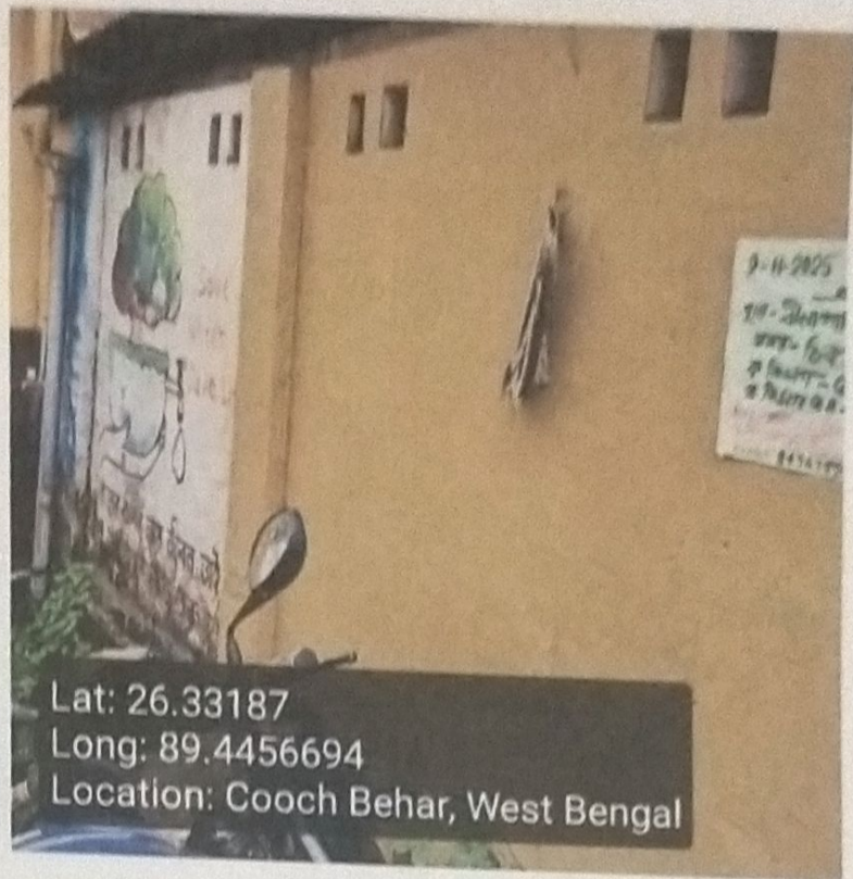
Lat: 26.33187 Long: 89.4456694 Location: Cooch Behar, West Bengal