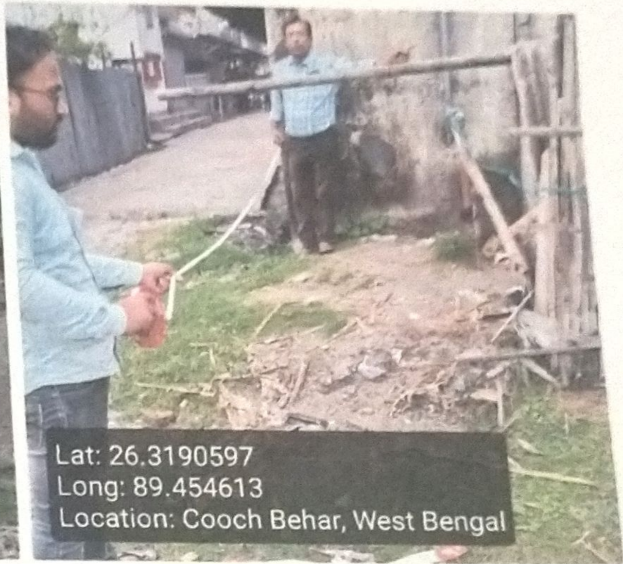
Lat: 26.3190597 Long: 89.454613 Location: Cooch Behar, West Bengal