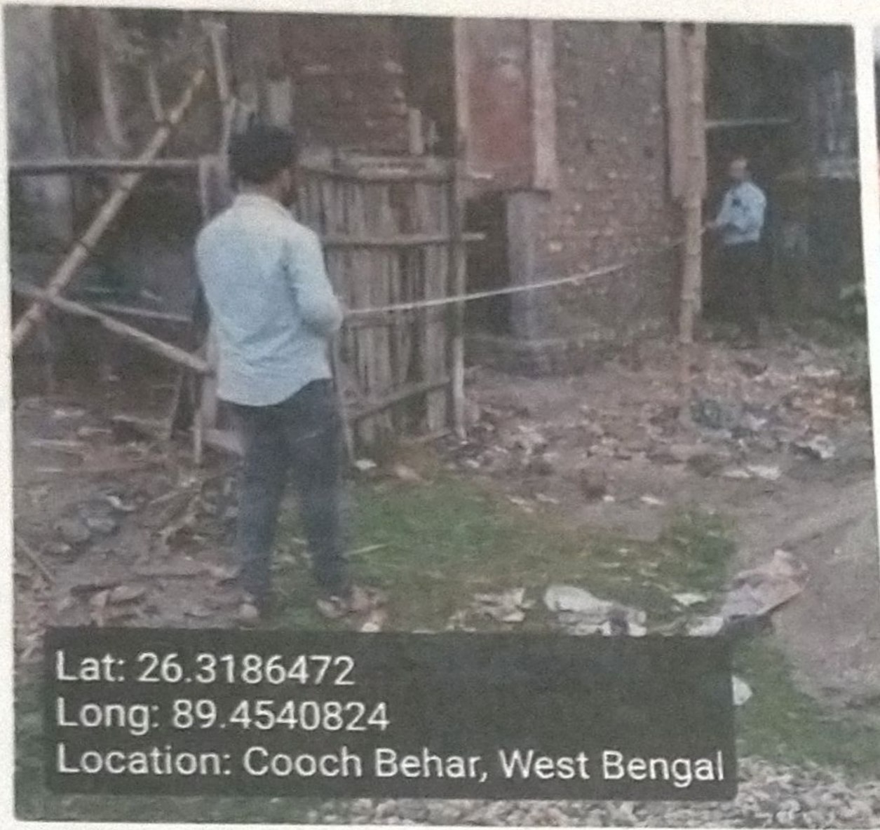
Lat: 26.3186472 Long: 89.4540824 Location: Cooch Behar, West Bengal